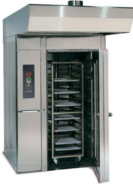
Model LRO-1 Shown (Rack(s) not included)