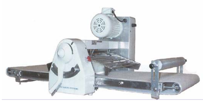
Model TTS-20 shown